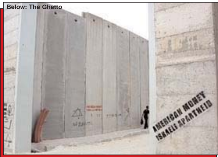
Below: The Ghetto

Jerusalem was a hub of cultural, religious and commercial activity for thousands of years. The city reflected a diversity of cultures, a rich ethnic diversity, and served as the major focal point for the three major religions . Moroccans, Africans, Syrians and others made pilgrimages to the city. It was a centre for traders and a key meeting point between east, west, north and south. Religious, social and educational institutions and societies thrived. The city prospered and grew over centuries.